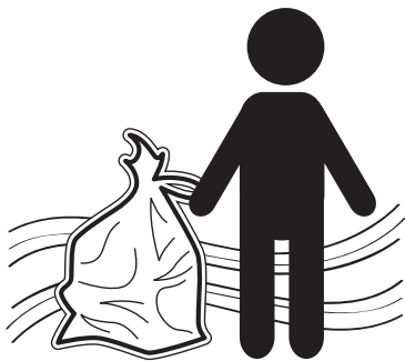
Pick up the trash