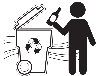
Dispose of trash properly